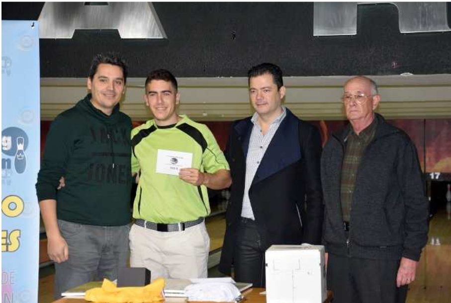
Tercer clasificado a scrath.